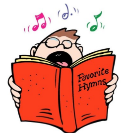
Hymns, first & last verses

We will continue to sing the first and last verses of our selected Gathering, Hymn of the Day and Sending hymns and receive communion in the pews using the prepackaged communion elements.